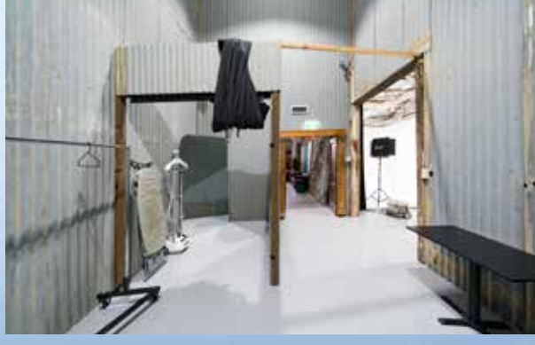
*Day Rate (10 hours): + GST (*8am – 6pm) *Half Day Rate (4 hours): + GST (*8.30am – 12.30pm / *12.30pm – 4.30pm)